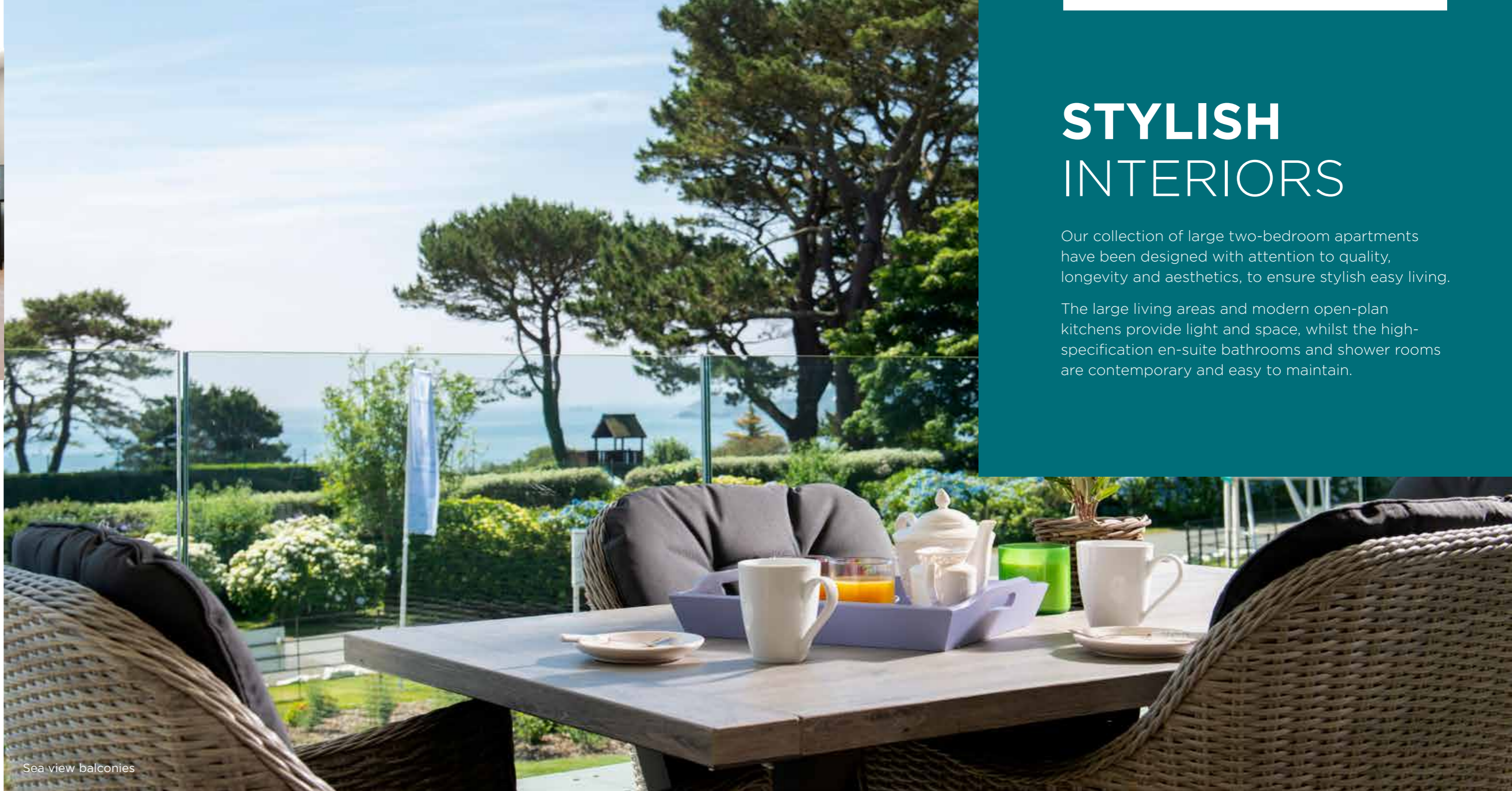
Sea view balconies