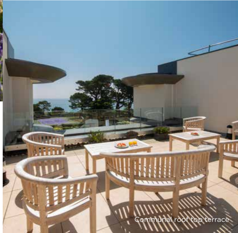
Communal roof top terrace