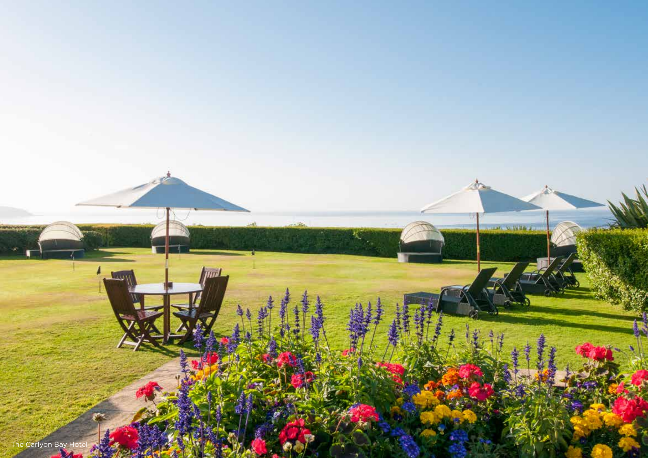
The Carlyon Bay Hotel